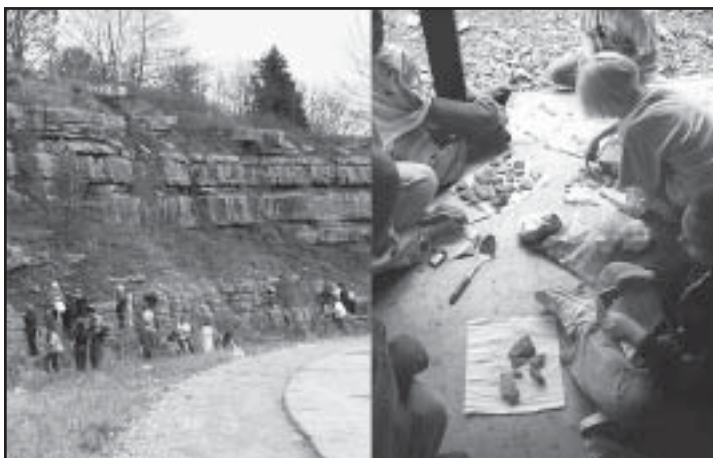
Young Earth Scientists at work.